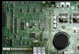
Electronic power circuit boards