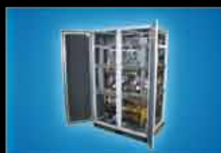
Electric charging station