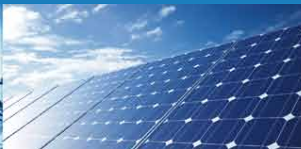
ENERGY STORAGE AND MANAGEMENT