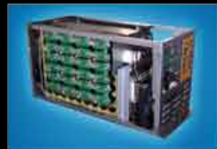
Energy storage modules