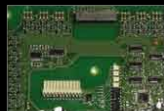
Embedded printed circuits