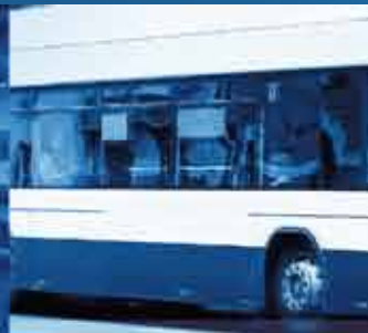
BUS / URBAN