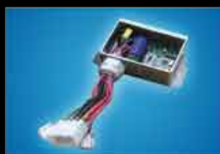
PWM control device